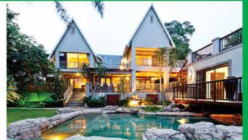
29 On St James Guest Lodge