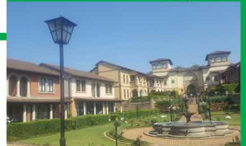
La Piazza, Plantations, Hillcrest